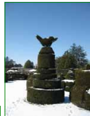
Scenes from Longwood Gardens