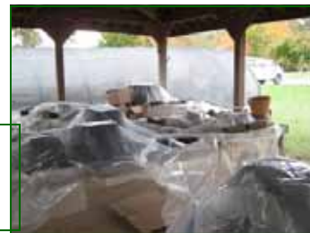
All wrapped up and curing. Same time next year if you missed this one!