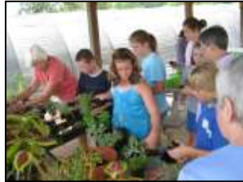
Tuesday's Sensory Plants and Herbs complete with a compact herb garden.