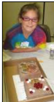
Thursday's Garden Mosaics brought out all of the creative genes.