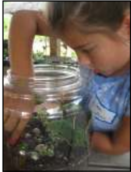
Monday's terrariums are a hit.