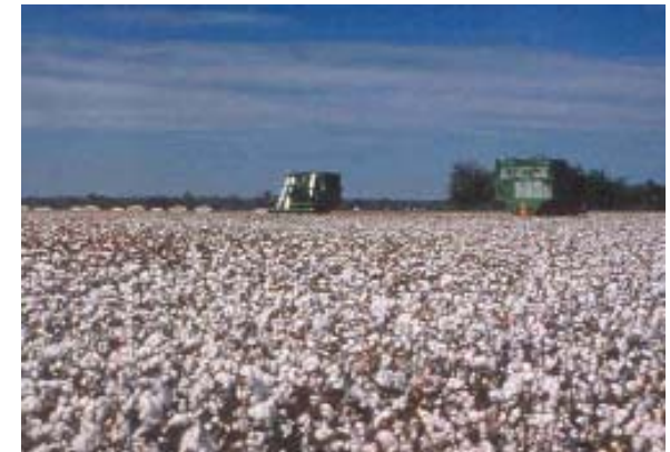
Figure 1. Nutrient management is critical for optimum crop production.

If the field being sampled has been divided into sections for various crops, submit a sample for each section—even if you now plan to grow the same crop across the entire field. Areas where liming or fertilizing patterns have differed from the rest of the field should also be sampled separately.